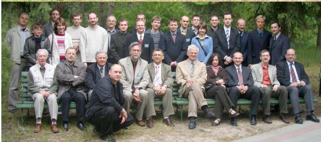
XVIII IEEE-SPIE WILGA Symposium, 29 May, 30 May, 31 May 2006 Photonics and Web Engineering, Electronics for HEP and Accelerators