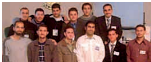
BAU student members at one of the SB's many events.