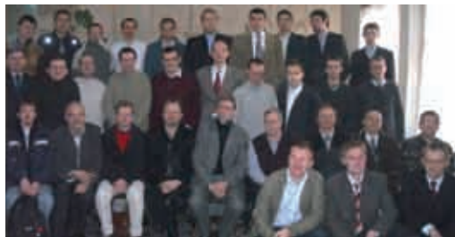
Participants at the Warsaw University of Technology.