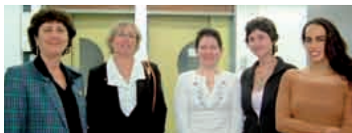
Above and left: The WIE group participates in Tel Aviv's feminist festival.