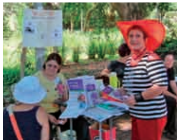
Below: At the second WIE meeting.