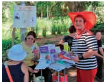
Below: At the second WIE meeting.