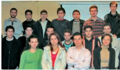
Charter members and board of directors of the branch.

We have set up a Micro-processors and Microcontrollers Committee, a Web Designing and Computer Based Designing Committee, and a Social Activity Committee.