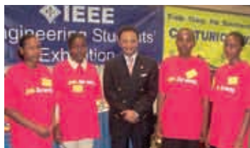
Kenyan section chair and prospective WIE Kenya Affinity Group members at the Engineering Students Exhibition in Nairobi, 2005.

Right now, our focus is to ensure that WIE affinity groups make an impact in their various sections. Please join the fun and participate in your