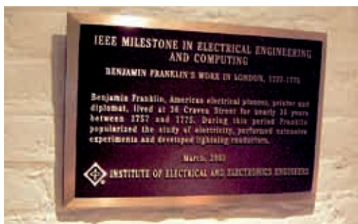
This IEEE Milestone plaque was dedicated at the house back in 2003, but now, following a massive restoration programme, the house is both a museum and student science centre.

The house has enjoyed a special relationship with IEEE since 1988 when it was