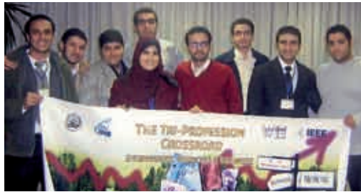
Above: IEEE AAST Student Branch Members at the Tri-Profession Crossroad event.

The link between engineering and medicine was established in sessions on biomedical engineering, led by