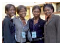
Top: Student Branch/GOLD Congress Local Organising Committee.