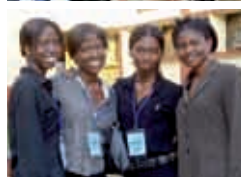
Top: Student Branch/GOLD Congress Local Organising Committee.