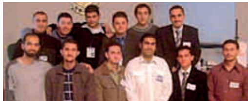
BAU student members at one of the SB's many events.

This committee has been working on the arrangements for our participation in the 6th Jordanian International Electrical & Electronics Engi-