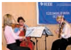
The Pichl string trio opens the meeting.

unhurried. All participants agreed that the talk was interesting and that the event was enjoyable.